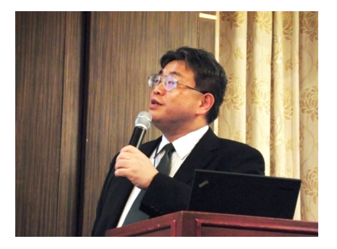
< Presentation by NACCS Center >