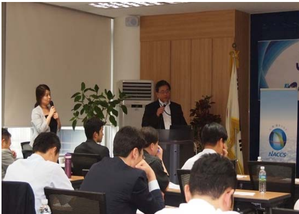
< Presentation by NACCS Center >