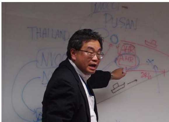
< FAQ session >