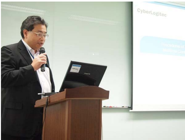
< Presentation by NACCS Center >