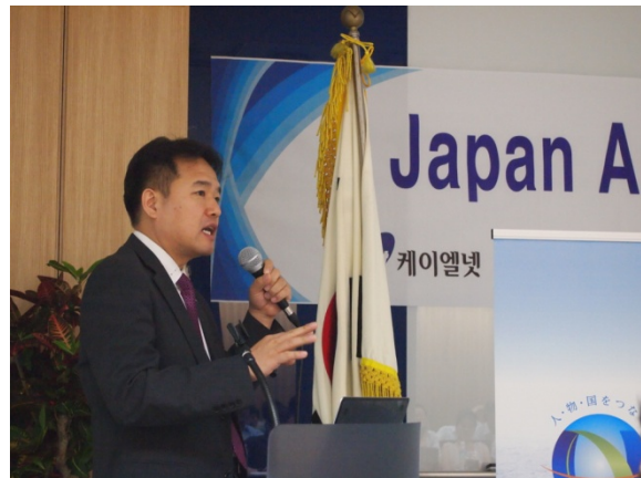
< Presentation by KLNET >