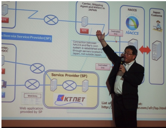
< Presentation by NACCS Center >